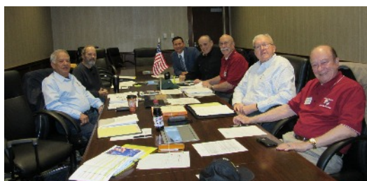
Board meeting February 2016